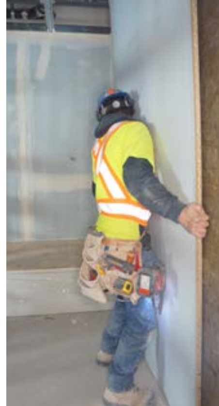
Drywall contractor lining up QuietRock CLD panel for installation.

QuietRock® by PABCO® Gypsum, the first and most technically advanced sound reducing drywall, was developed in 2003 using modern chemistries, techniques and a Silicon Valley approach to building science. Through continued innovation, including the patented EZ-Snap® Technology, QuietRock® Sound Reducing Drywall is a cost effective alternative to conventional approaches for building acoustically rated walls.