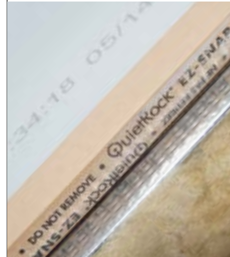
QuietRock EZ-SNAP Mold Resistant panel installed on steel framing.