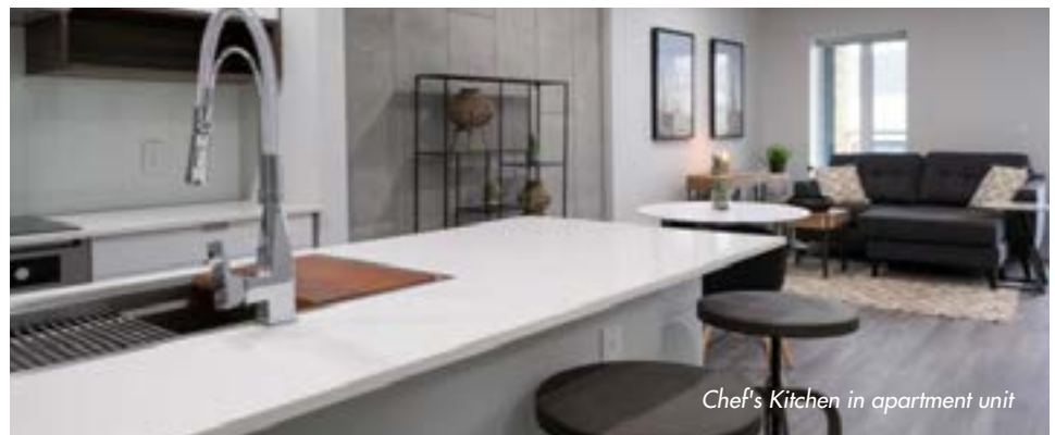
Chef's Kitchen in apartment unit