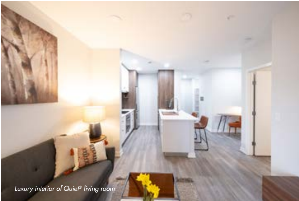
Luxury interior of Quiet® living room