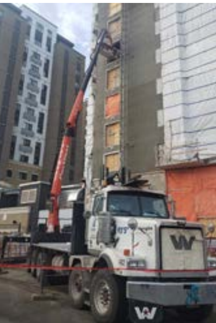
Pacific West Supply delivering QuietRock® for the project.