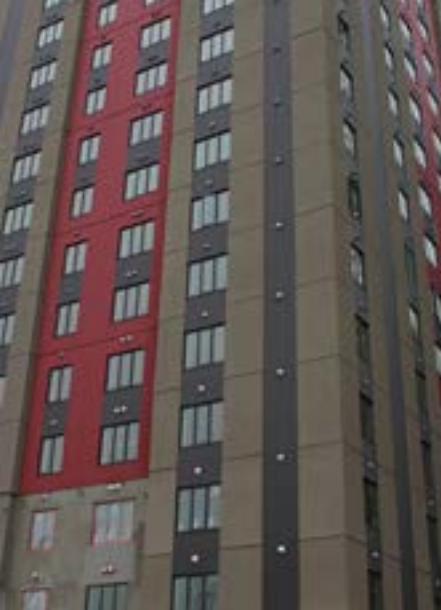
Orion at Lumino Park exterior.