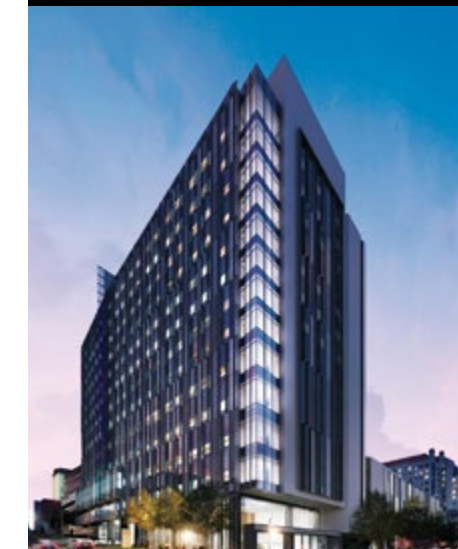
Cathedral Hill Hospital