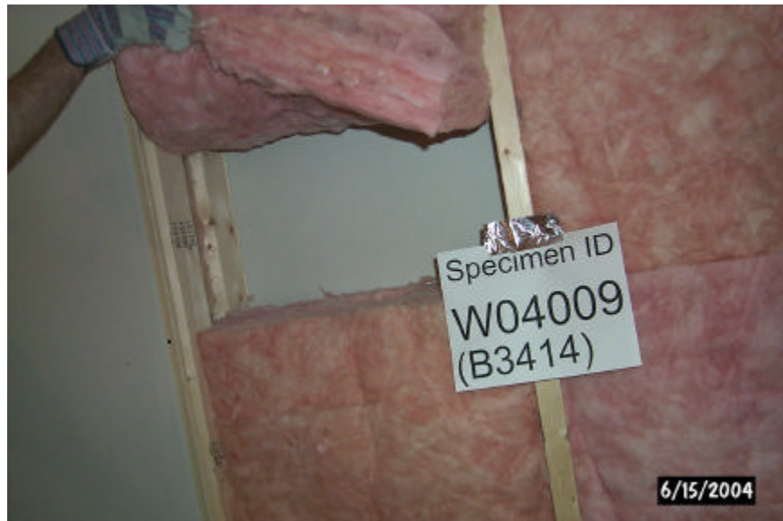
Figure 1: The Specimen B3414-1 showing the 241 mm of insulation in the double wood stud cavity.

A double row of wood studs were spaced at 610mm on center, separated by a 76 mm air space. The glass fibre batts with a thickness of 241 mm were installed in the double wood stud cavity. A single layer of 16mm QuietRock QR-530 Serenity drywall was attached vertically to the wood studs on both sides with Type S drywall screws, 41mm long and spaced at 406mm oc along the edges and in the field. A product identified by the client as QuietSeal was used to seal all the joints of the QuietRock QR-530 Serenity then covered with metal tape. The perimeter of the specimen was also caulked with QuietSeal and covered with metal tape.