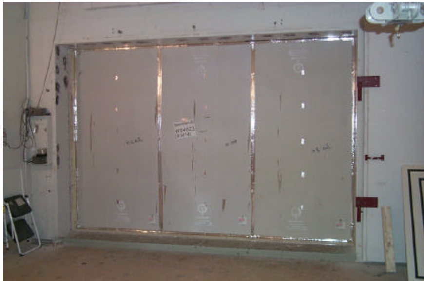
Figure 1: The Specimen B3414-6 installed in the IRC acoustical wall test frame.

single wood stud cavity. A single layer of 16mm QuietRock QR-530 Serenity with a single layer of 16mm gypsum board were installed vertically on one side of the wood studs. A single layer of 16mm of gypsum board was installed vertically on the other side of the wood studs. All were attached on the wood studs with Type S drywall screws, 41mm long and spaced at 406mm oc along the edges and in the field. The joints of the gypsum board were staggered by 610mm with the joints of the QuietRock QR-530 Serenity. A product identified by the client as QuietSeal was used to seal all the joints of the QuietRock QR-530 Serenity and of the gypsum boards, then covered with metal tape. The perimeter of the specimen was also caulked with QuietSeal and covered with metal tape.