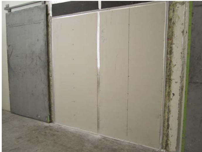
Figure 2: Receiving room side sheeting installed and sealed

Sheeting panels on both sides of the partition were shimmed at installation so equal gaps were at the top and bottom. Gaps were less than 1/4" in all cases. Shims were removed after sheeting was fastened and the perimeter was sealed on the source and receiving room sides with acoustic sealant, 1-7/8" wide, 5 mil aluminum foil tape and 1 7/8" wide dense putty tape. On both sides of the partition the vertical seams were sealed with acoustic sealant and 1-7/8" wide, 5 mil aluminum foil tape.