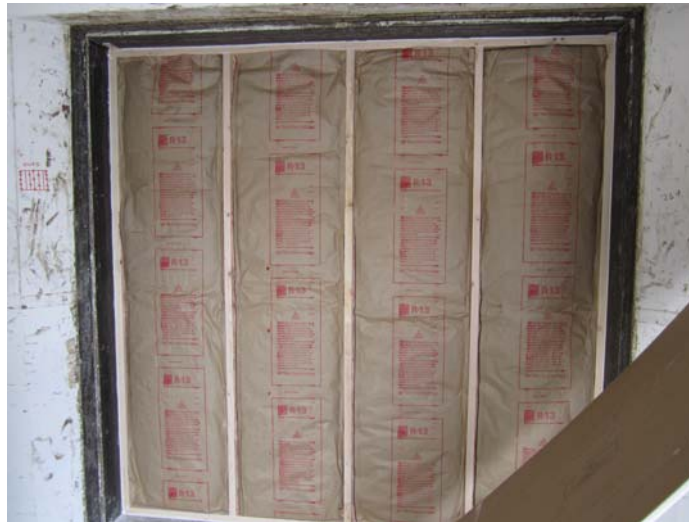
Figure 1: Insulated wood stud frame viewed from source room side