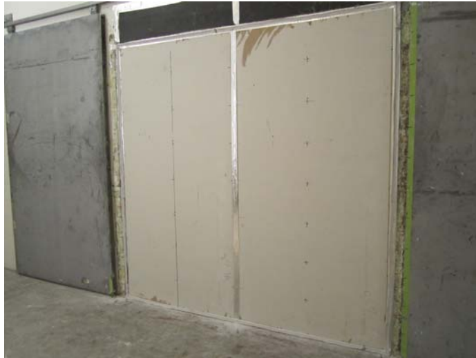
Figure 3: Receiving room side sheeting installed and sealed

The receiving room sheeting was a single layer of 5/8" thick QuietRock ES acoustically enhanced gypsum board. The QuietRock ES was fastened vertically to the source room side of the steel stud frame with 1-1/4" long, type S drywall screws spaced at 12" on center. The source layers were comprised of two complete 4' by 8' sheets.