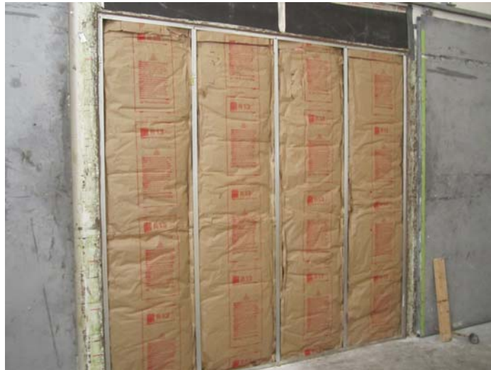
Figure 1: Insulated steel stud frame viewed from receiving room side