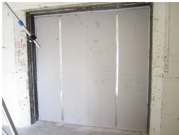
Figure 2: Source room side sheeting installed and sealed

The source room sheeting was a single layer of 5/8" thick Type X gypsum board. The gypsum board sheets were fastened vertically to the source room side of the steel stud frame with 1-1/4" long, type S drywall screws spaced at 12" on center. The source layer was comprised of two 4' by 8' sheets, however one of the sheets was cut lengthwise and installed on either side of a complete 4'x8' sheet in order to stagger the seams relative to the receiver room side sheeting. Figure 2 is a photograph of the source room side with the staggered seam installation.