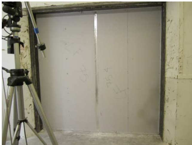
Figure 2: Source room side sheeting installed and sealed

The outer source side sheeting was a second layer of 5/8" thick Type X gypsum board. The gypsum board sheets were fastened vertically to the source room side of the steel stud frame with 2" long, type S drywall screws spaced at 12" on center. The source layer was comprised of two 4' by 8' sheets. The seams were staggered from the inner to the outer layer. Figure 2 is a photograph of the source room side showing the outer layer sheeting.