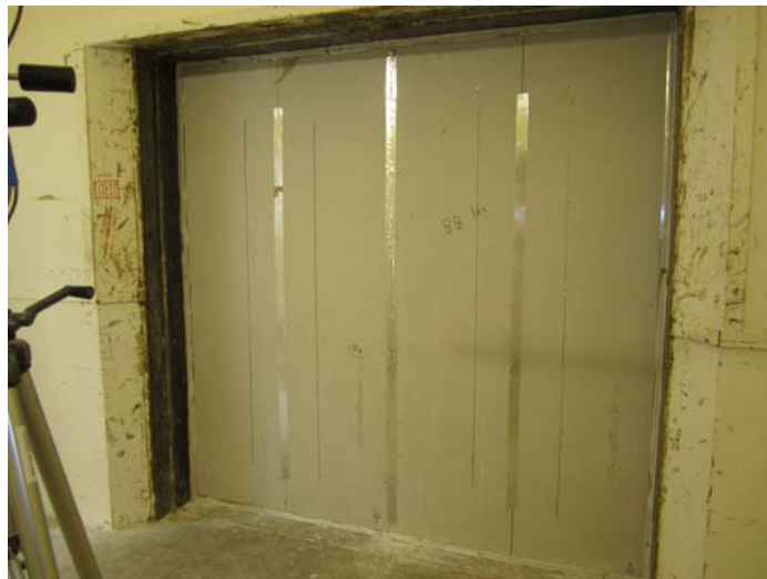
Figure 2: Source room side QuietRock ES installed and sealed in the specimen opening

The single source room side sheeting layer consisted of two 5/8" thick 4' by 8' sheets of QuietRock ES (EZ-SNAP) noise reducing drywall. The QuietRock ES sheets were fastened parallel to the steel stud frame with 1-1/4" long, type S drywall screws spaced at 12" on center. The single layer was comprised of two complete 4' by 8' sheets. Figure 2 is a photograph of the source side sheeting.