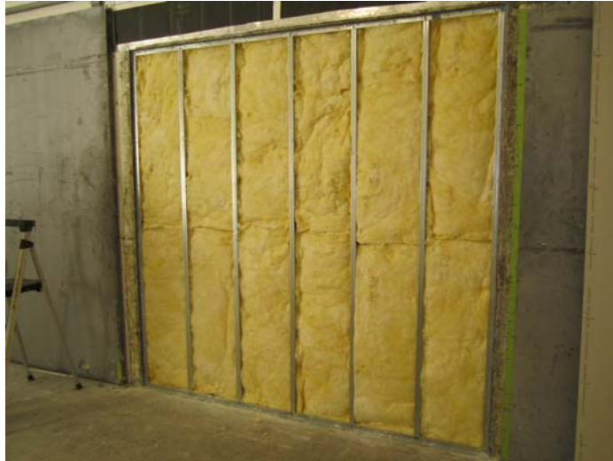
Figure 1: Insulated steel stud frame viewed from receiving room side