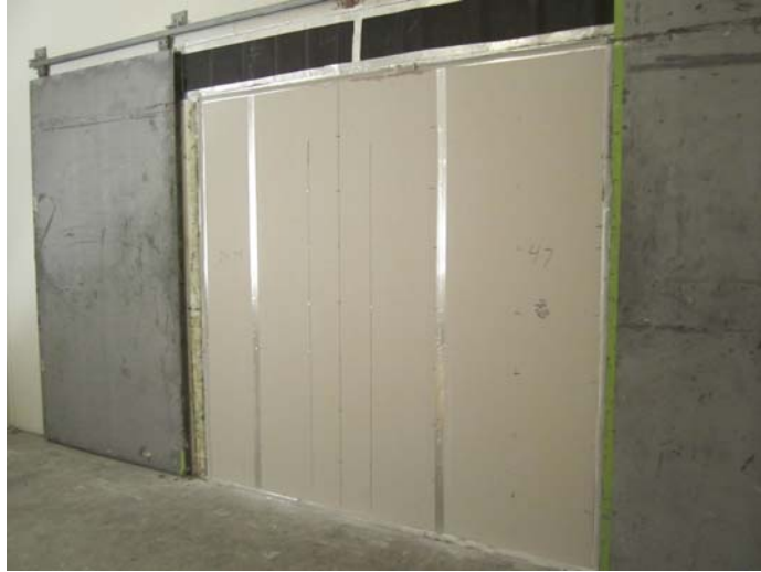
Figure 3: Receiving room side sheeting installed and sealed in the specimen opening

The receiving room side sheeting layer consisted of a single layer of 5/8" thick type X gypsum board. The type X gypsum board sheets were fastened parallel to the steel stud frame with 1-1/4" long, type S drywall screws spaced at 12" on center. The single layer was comprised of three sections to provide seams that were staggered from those on the source side. Figure 3 is a photograph of the receiving room side sheeting.