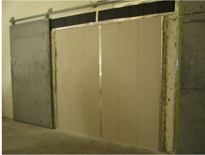
Figure 3: Receiving room side sheeting installed and sealed in the specimen opening

The receiving room side sheeting layer consisted of a two layers of 5/8" thick type X gypsum board. The inner layer of type X gypsum board sheets were fastened parallel to the steel stud frame with 1-1/4" long, type S drywall screws spaced at 12" on center. The inner layer was comprised of three sections to provide seams that were staggered from those on the source side. The outer layer of type X gypsum board was fastened parallel to the studs with 1-5/8" type S screws driven through the inner layer sheets to the steel studs. The outer layer consisted of two full 4' x 8' sheets. Figure 3 is a photograph of the receiving room side sheeting.