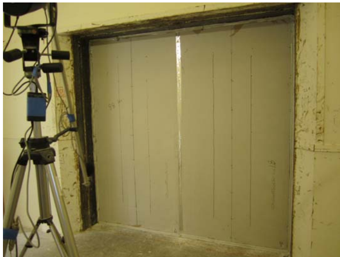
Figure 2: Source room side QuietRock ES installed and sealed in the specimen opening

The single source room side sheeting layer consisted of two 5/8" thick 4' by 8' sheets of QuietRock ES (EZ-SNAP) noise reducing drywall. The QuietRock ES sheets were fastened parallel to the steel stud frame with 1-1/4" long, type S12 drywall screws spaced at 12" on center. The single layer was comprised of two complete 4' by 8' sheets. Figure 2 is a photograph of the source side sheeting.