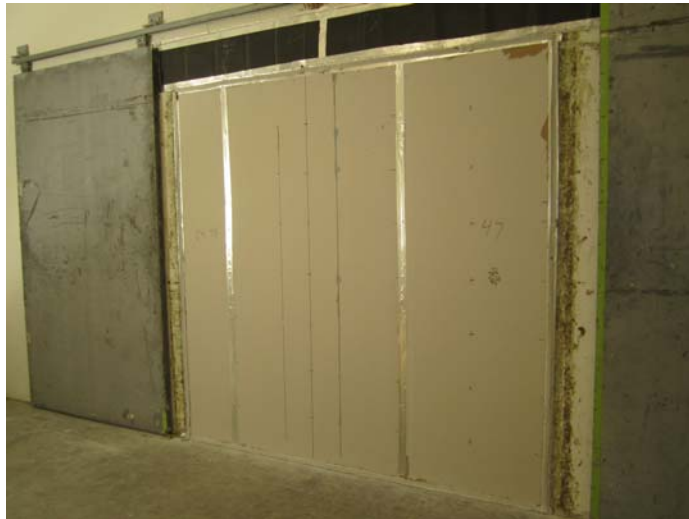
Figure 3: Receiving room side sheeting installed and sealed in the specimen opening

The single receiving room side sheeting layer consisted of two 5/8" thick 4' by 8' sheets of type X gypsum panels. The type X gypsum sheets were fastened parallel to the steel stud frame with 1-1/4" long, type S12 drywall screws spaced at 12" on center. On the receiving room side the sheeting was comprised of three sections to provide seams that were staggered from those on the source side. Figure 3 is a photograph of the receiving room side sheeting.