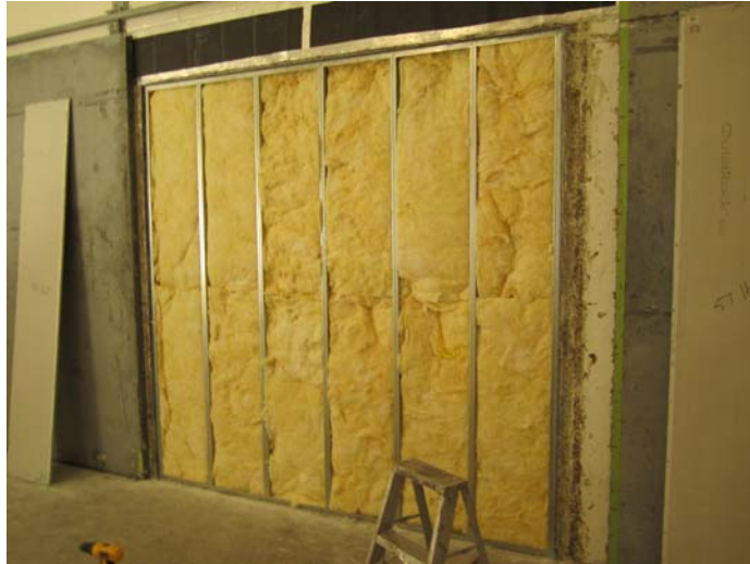
Figure 1: Insulated steel stud frame viewed from receiving room side