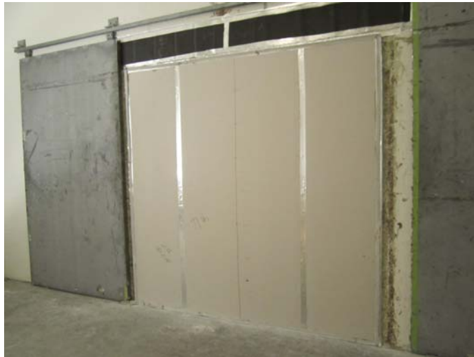
Figure 3: Receiving room side sheeting installed and sealed in the specimen opening

The single receiving room side sheeting layer consisted of two 5/8" thick 4' by 8' sheets of type X gypsum board. The type X gypsum sheets were fastened parallel to the steel stud frame with 1-1/4" long, type S12 drywall screws spaced at 12" on center. On the receiving room side the sheeting was comprised of three sections to provide seams that were staggered from those on the source side. Figure 3 is a photograph of the receiving room side sheeting.