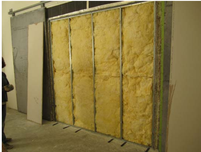
Figure 1: Insulated steel stud frame viewed from receiving room side