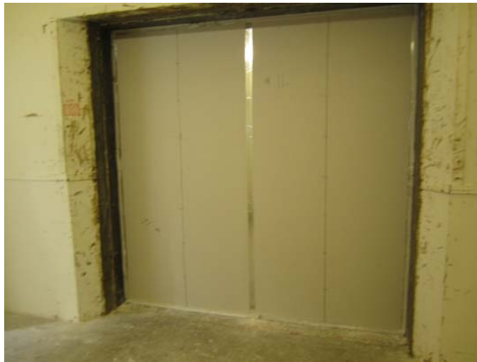
Figure 3: Receiving room side sheeting installed and sealed in the specimen opening

The receiving room side sheeting layer consisted of a two layers of 5/8" thick type X gypsum board. The inner layer of type X gypsum board sheets were fastened parallel to the steel stud frame with 1-1/4" long, type S12 drywall screws spaced at 12" on center. The inner layer was comprised of three sections to provide seams that were staggered from those on the source side. The outer layer of type X gypsum board was fastened parallel to the studs with 1-5/8" type S12 screws driven through the inner layer sheets to the steel studs. The outer layer consisted of two full 4' x 8' sheets. Figure 3 is a photograph of the receiving room side sheeting.