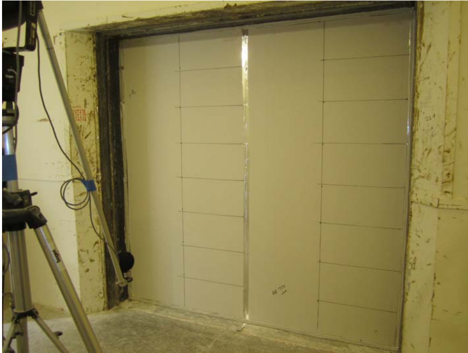
Figure 2: Source room side QuietRock 510 installed and sealed in the specimen opening

The receiving room side sheeting layer consisted of a single layer of 1/2" thick gypsum board. The gypsum board sheets were fastened parallel to the steel stud frame with 1-1/4" long, type S drywall screws spaced at 12" on center. The single layer was comprised of three sections to provide seams that were staggered from those on the source side. Figure 3 is a photograph of the receiving room side sheeting.