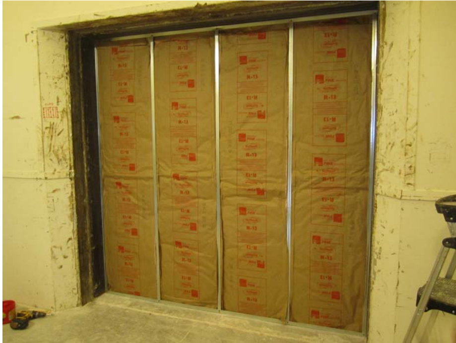
Figure 1: Insulated steel stud frame viewed from source room side