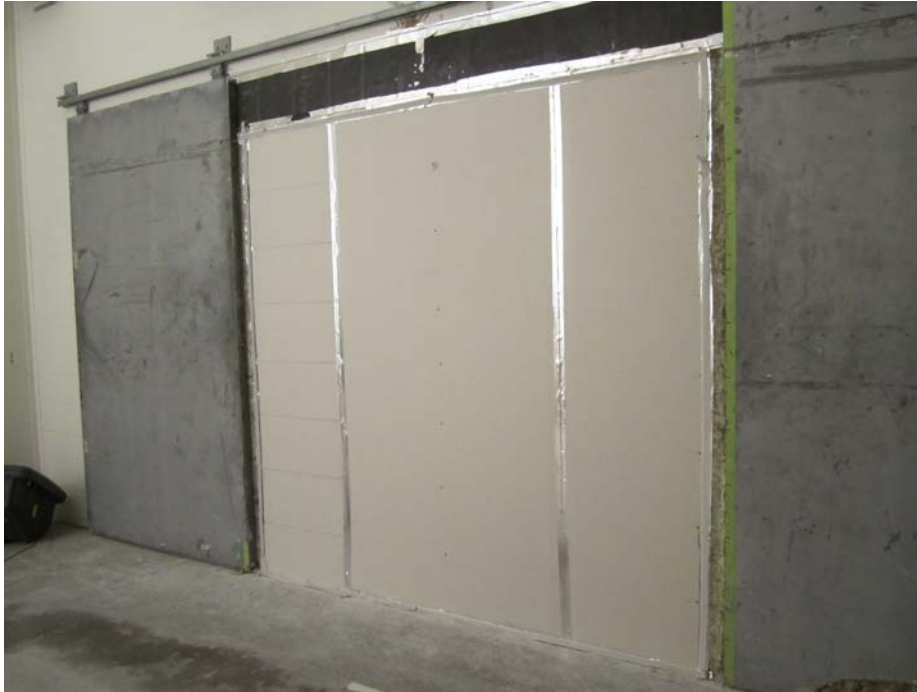
Figure 3: Receiving room side sheeting installed and sealed in the specimen opening

Panels were shimmed at installation so equal gaps were at the top and bottom. Gaps were less than 1/4" in all cases. Shims were removed after sheeting was fastened and the vertical seams were sealed on the source and receiving room sides with QuietSeal Pro acoustical sealant and 1-7/8" wide, 5 mil aluminum foil tape. The perimeter of both sides of the sample were sealed with QuietSeal Pro acoustical sealant, 5 mil aluminum foil tape and 7/8" dense putty tape.