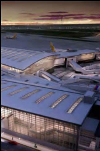
The new International terminal at Calgary International Airport will effectively double the overall facility's passenger service space. Over 15 million air travelers passed through YYC in 2015.