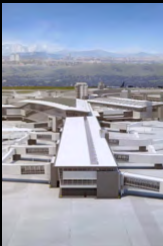
Calgary International Airport's $2 billion dollar expansion program will add 22 aircraft gates, including two for wide body jets, as well as Canada's longest runway.

to boarding gates. This arrangement keeps restaurants and other retail services handy, and will also help manage gate changes with ease.