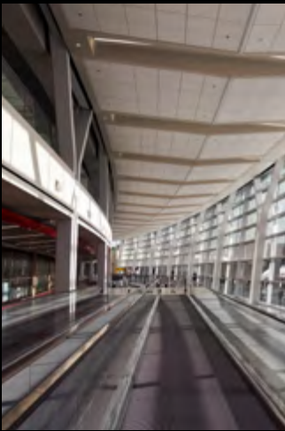
Connections corridor expedites traffic flow in Calgary International Airport's new terminal, and its all-new Connection Center will enable passengers to make global connections.