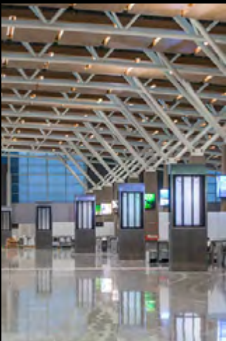
Canadian and U.S. Customs areas in Calgary's new International Terminal incorporate PABCO Gypsum's QuietRock sound deadening drywall, specified due to its high STC (Sound Transmission Class) ratings, even on closely spaced 20-gauge steel studs.