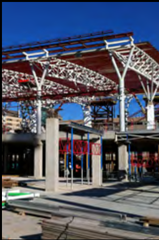
The International room at Calgary Airport's new 2 million sq. ft. terminal includes Customs areas for Canadian and U.S. border agencies. To meet the agencies' sound attenuation STC rating requirements cost-effectively, PABCO Gypsum QuietRock ES sound-deadening drywall is being installed.